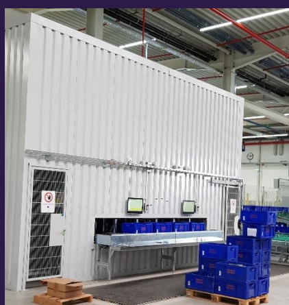
Line Side Delivery