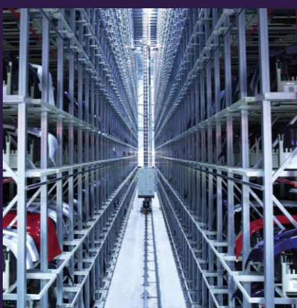
Single Product Delivery